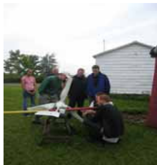
RE team and volunteers installing second wind turbine

The small army of staff and volunteers raised the 45 foot AirX tower without a hitch, despite what was at times harrowing weather.