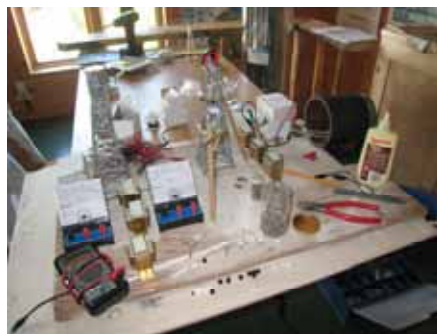
Three phase power transformation and transmission demonstration

sive, hands-on suite of activities and demonstrations intended for school group visits to the centre or staff visits to schools in the province. More interactive displays and activities are being added to our already comprehensive suite of demonstrations.